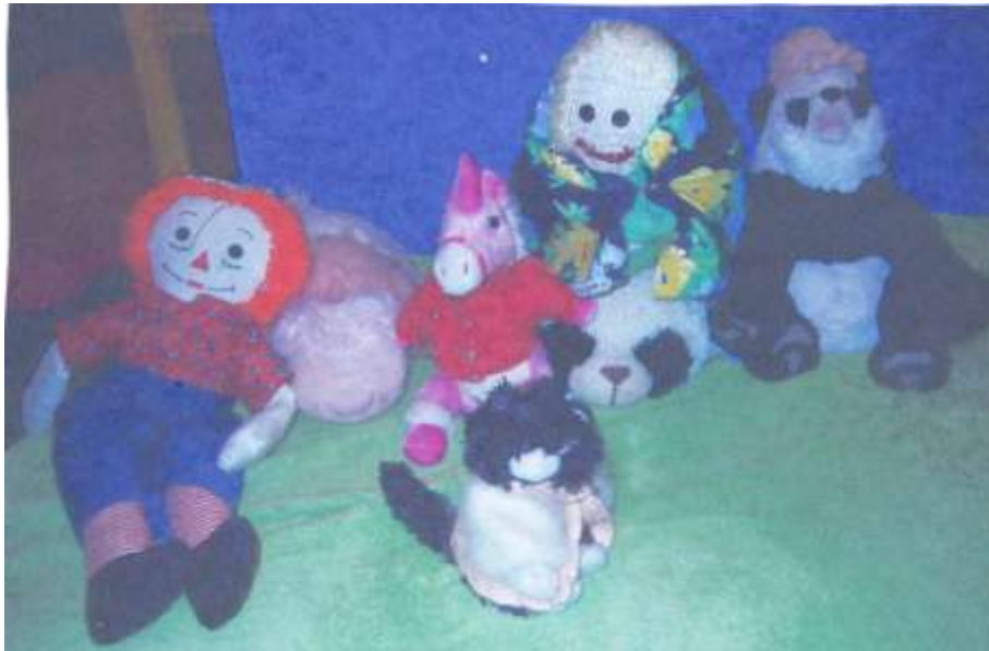
Some of Kiera's dolls and stuffed animals